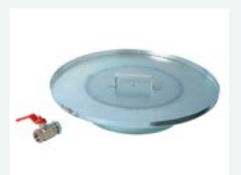
Grill and valve for separating solids from liquids inside the container