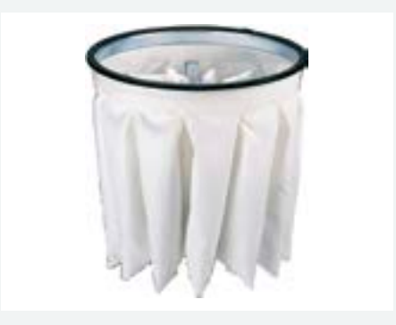
Standard star filter