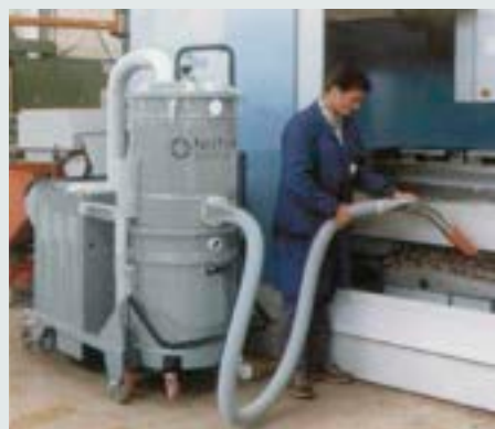
Metal sector: collection of shavings on machine tool