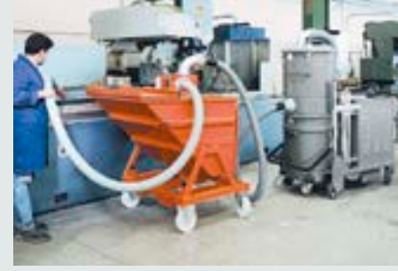
Metal sector: collection of shavings and oils