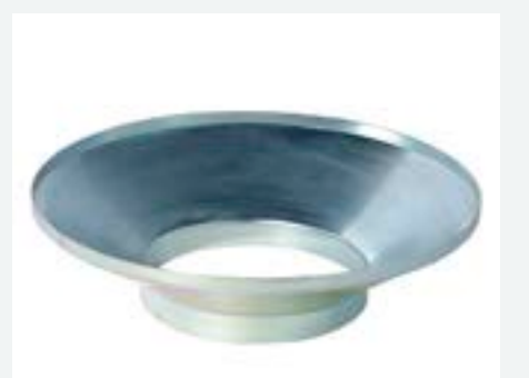
Removable cyclone that protects the primary filter from becoming in direct contact with incoming liquids or sharp objects