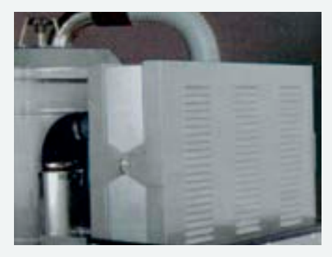
Absolute exhaust air filter