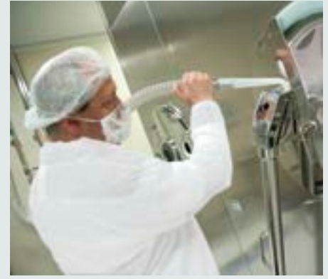
Cleaning of a coating pan