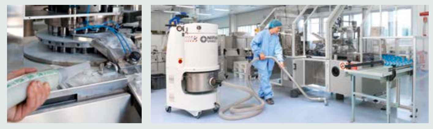
Cleaning of a processing machine