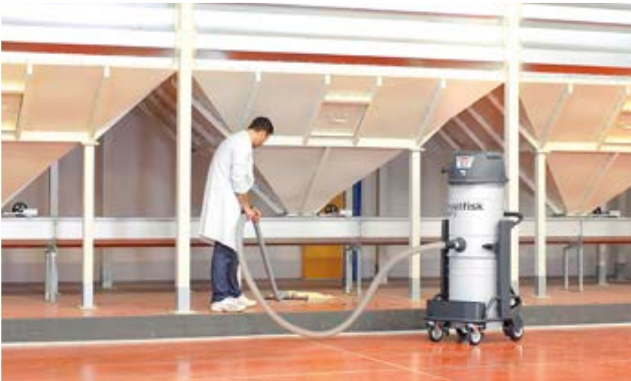
Cleaning of production lines.

Lifting system: an useful kit, consisting of support, belt and handles, allows to move the vacuum by a forklift or a bridge crane.