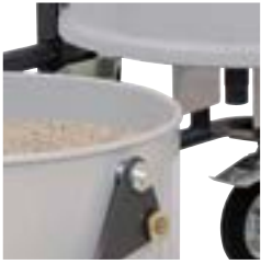
Solid cut-off system (SC)