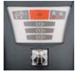
Electronic board control