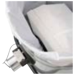
Safe bag for toxic material