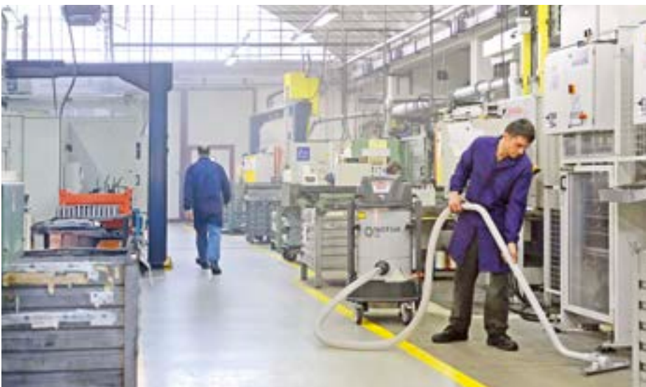
Cleaning of a metal company.