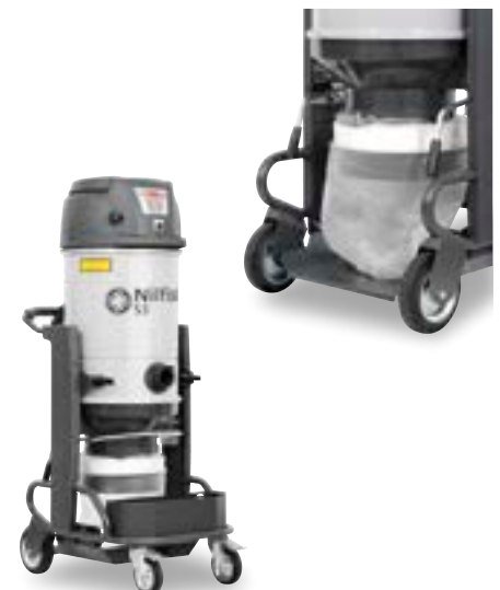
S3 with gravity unload system with Longopac®.