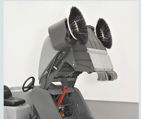
The SW8000 has a superb high-dump capability up to 152 cm from ground level for easy and convenient emptying